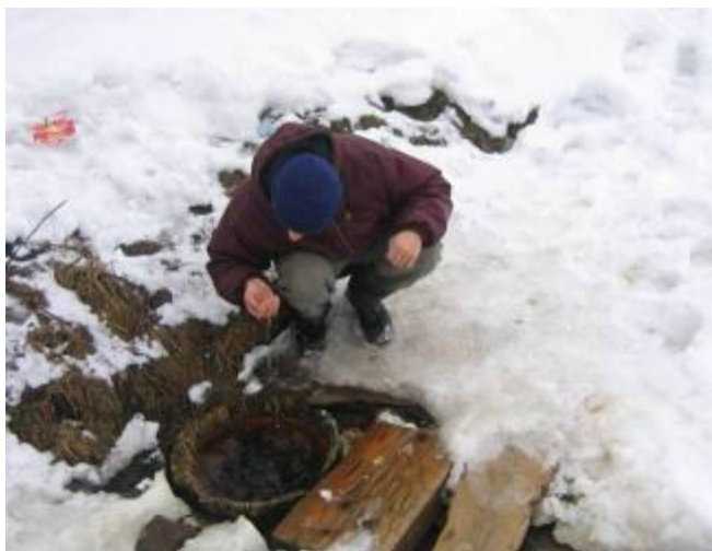
Collecting mineral water samples