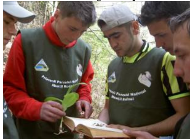
Identifying plant species