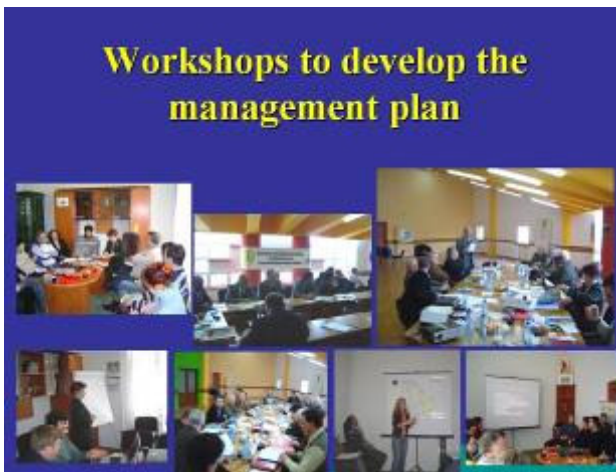
Stakeholder meetings and workshops

Overall, this project has been successful in achieving the proposed outputs as detailed in the logical framework, which formed the basis for evaluation and monitoring of progress (see point 6). The photos presented here emphasise various aspects of the work carried out. More photos are included in Annex 7.