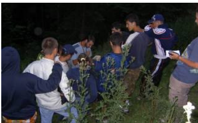
Using live traps for small mammal studies