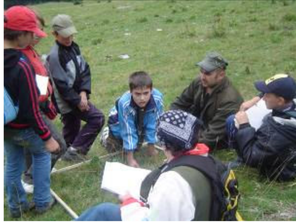
Using quadrates for plant surveys