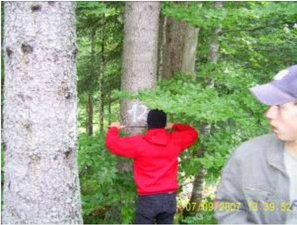
Measuring tree DBH