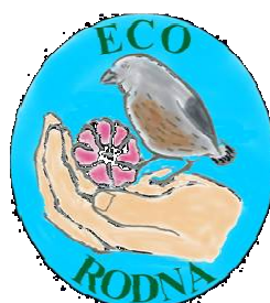
Darwin Clubs logo