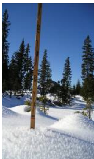
Measuring the snow and ice layer depth