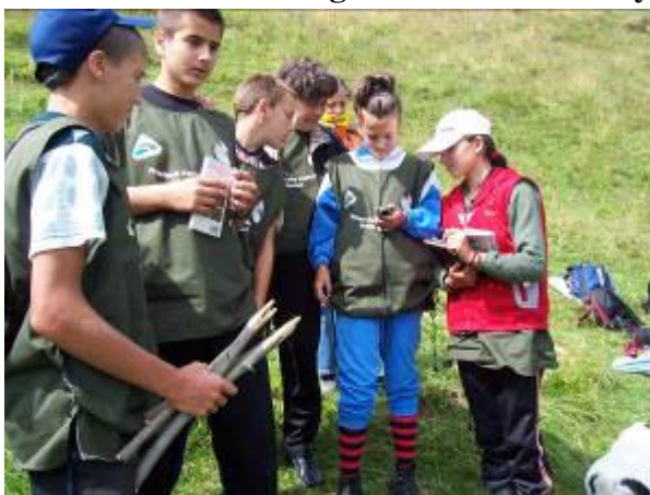
Using a GPS