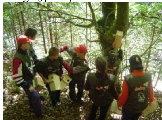
Dormouse houses used for monitoring populations