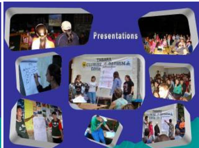
Presentations made by the project team